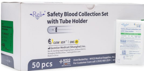
Pictured right: GSBCS25G-12