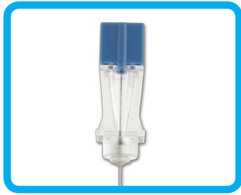
Large clear hub