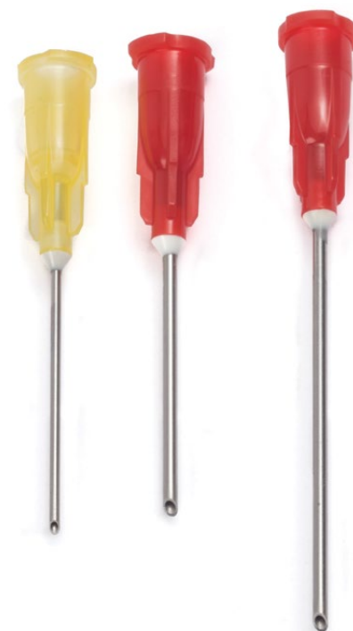
Reli® Blunt Fill Needles (Sterile)

As a leading NMSDC Diversity Certified Supplier, MYCO Medical is committed to “Bringing Reliability, Innovation and Value” to the Healthcare industry with an emphasis on “physician preference” surgical devices and disposables.