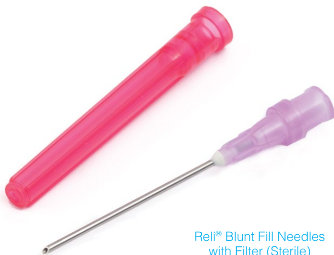
Reli® Blunt Fill Needles with Filter (Sterile)